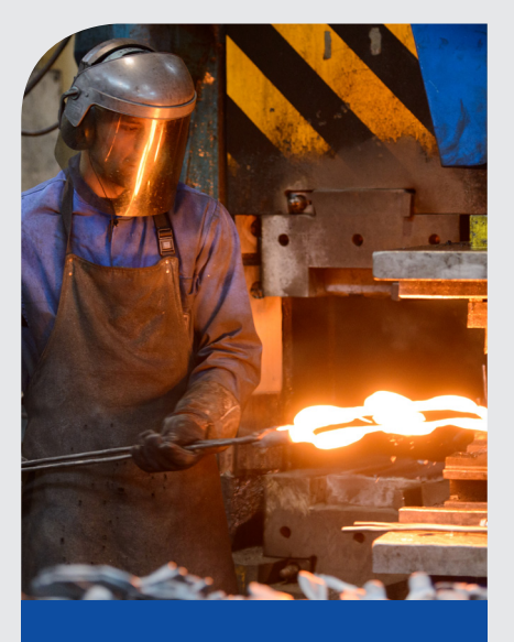
STAMPING / MACHINING / WELDING pommier neufmanin